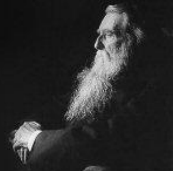
John Ruskin (1819 - 1900)

The common law of business balance prohibits paying a little and getting a lot; it cannot be done. If you deal with the lowest bidder, it is well to add something for the risk you run, and if you do that you will have enough to pay for something better"